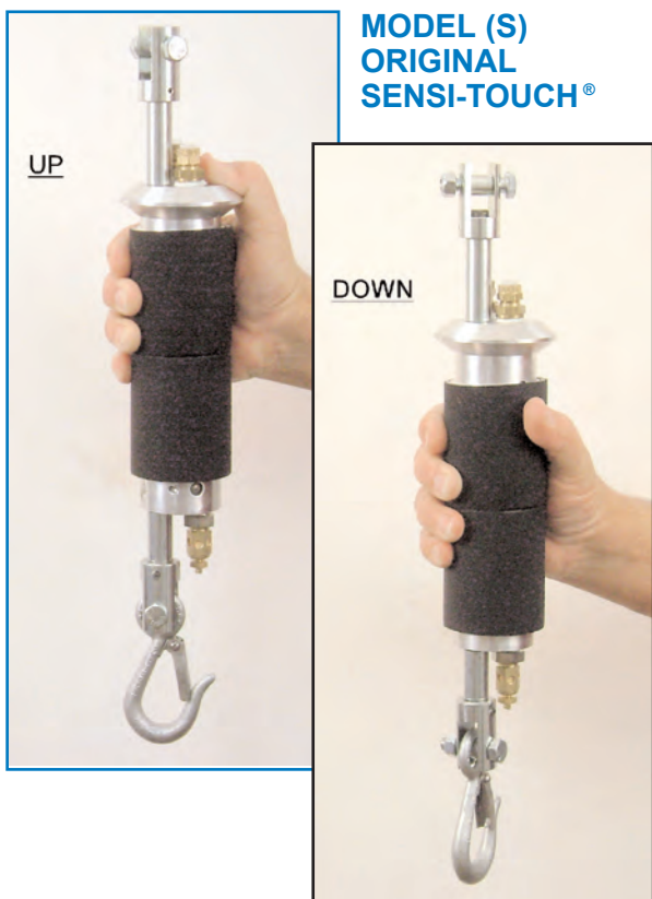
MODEL (S) ORIGINAL SENSI-TOUCH®

OPERATION: A thumb ring at the top of the Controls provides better control on the upstroke. For the downstroke simply pull down on the control.